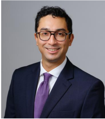
Maxwell Walters Investment Banking